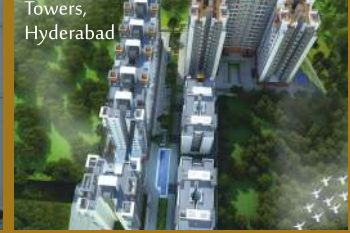
Ramky Towers, Hyderabad