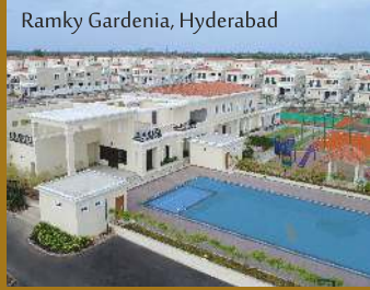
Ramky Gardenia, Hyderabad