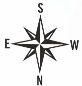
KEY PLAN - BLOCK A