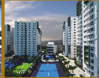
Ramky Towers, Hyderabad