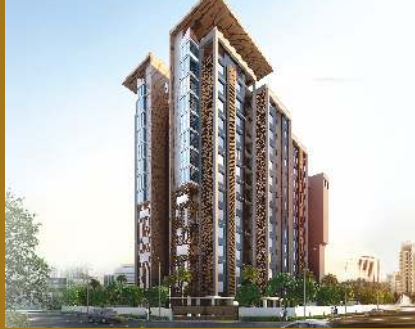
RWD Corniche, Egmore