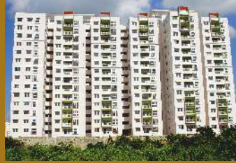
Ramky Kosmos, Hyderabad