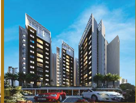
RWD Lemongraz, Ambattur