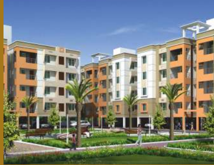
RWD Elysium, Kelambakkam