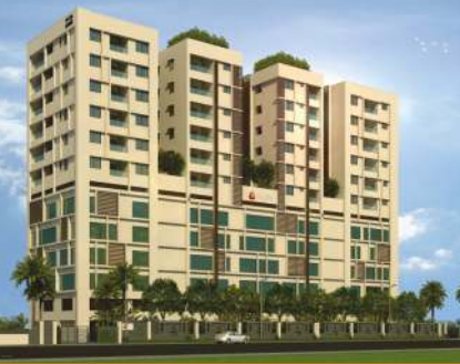
RWD Atlantis, Nelson Manickam Road