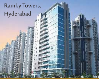
Ramky Towers, Hyderabad