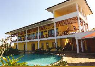
RWD Ecpolis, Vedanthangal