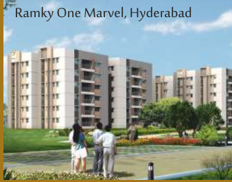
Ramky One Marvel, Hyderabad