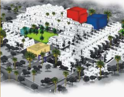
RWD Palm, Medavakkam